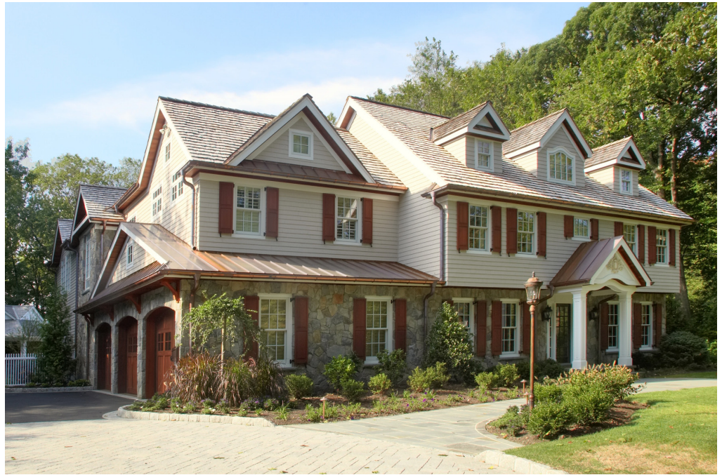
Allendale, New Jersey, home after construction. Image courtesy of Z+ Architects.

With Revit Architecture, Autodesk Seek, and new BIM-ready Pella product models, Z+ Architects transforms a house.