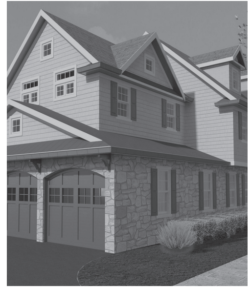
Architects created high-resolution images in Autodesk Revit Architecture.

Pella Corporation has realized significant benefits from its investment in the Pella models. "The number of downloads we have seen at the Autodesk Seek site is absolutely out of this world," says Zeimetz. "These models definitely give us a competitive advantage."